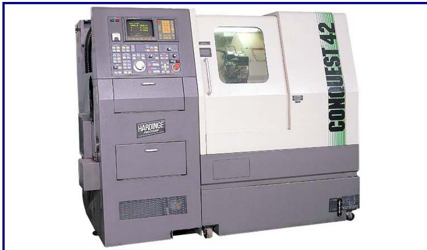
Hardinge CNC Lathe (USA)