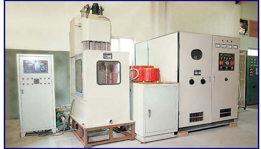
High Frequency Induction Furnace