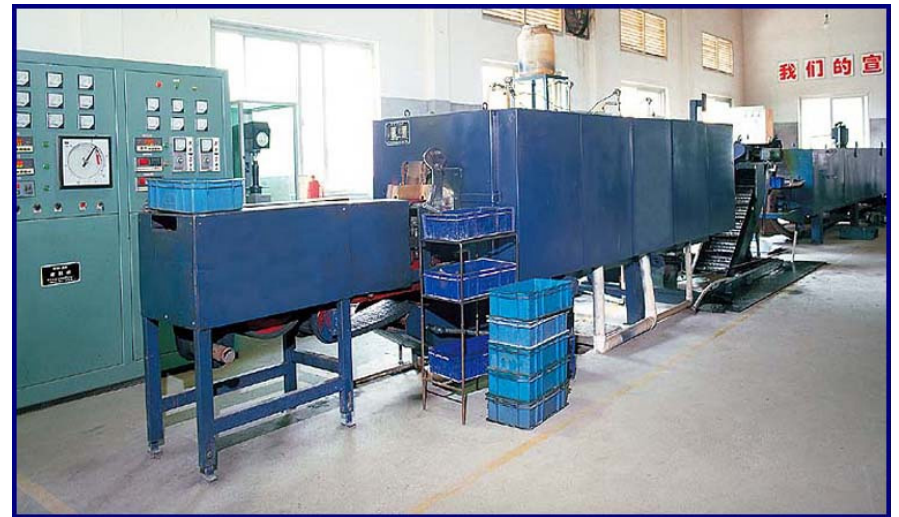
Mesh-Belt Furnace (Carbon Steel)