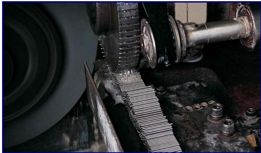
End Surface Grinding