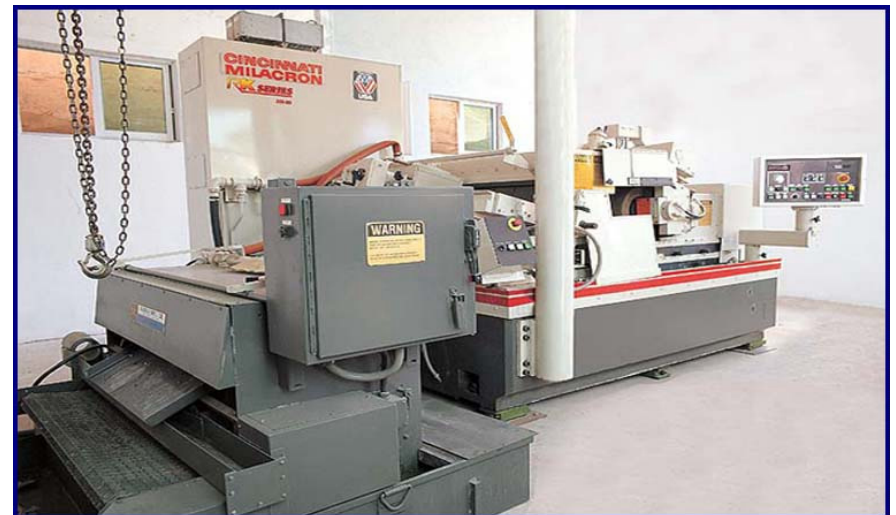
Cincinnati Centerless Grinder (USA)