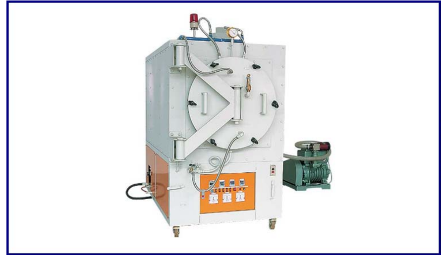
Vacuum Furnace (China)