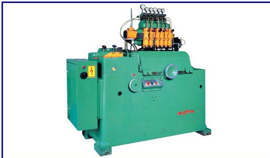
Supfina Ultra-Precision Lapping Machine (Germany)