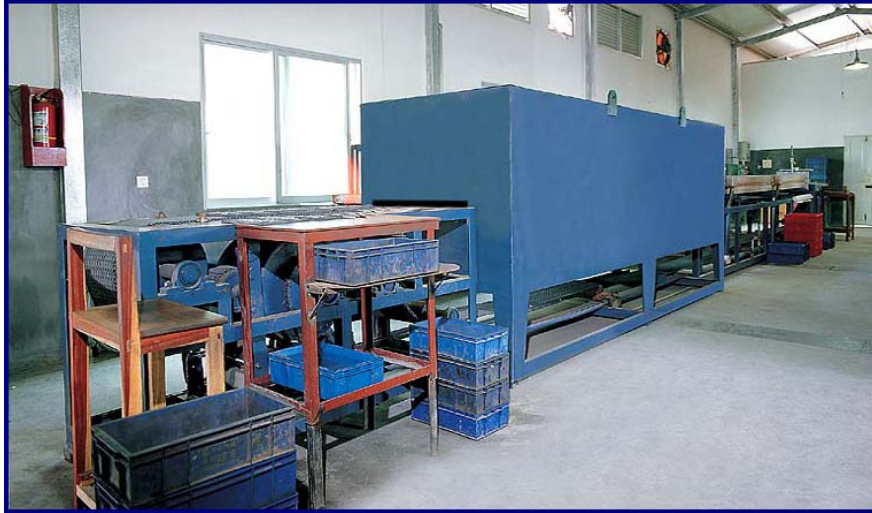
Mesh-Belt Furnace (Stainless Steel)