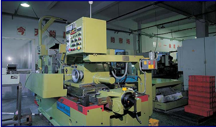
Koyo KC-2000 Centerless Grinder (Japan)